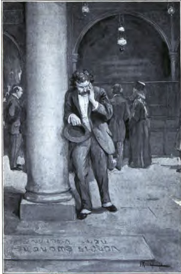
THE TOMB OF ADAM